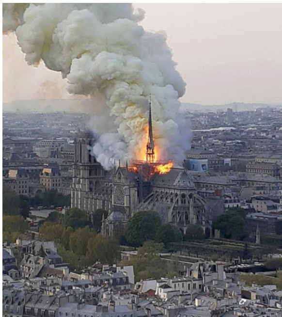
Left: The cathedral in flames on 15 April 2019.

This massive and complex project is due to be completed by the end of 2024, as President Macron ends his second term.