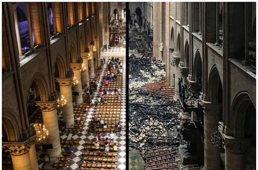
Below: The interior of the cathedral before the fire (left) and afterwards (right)